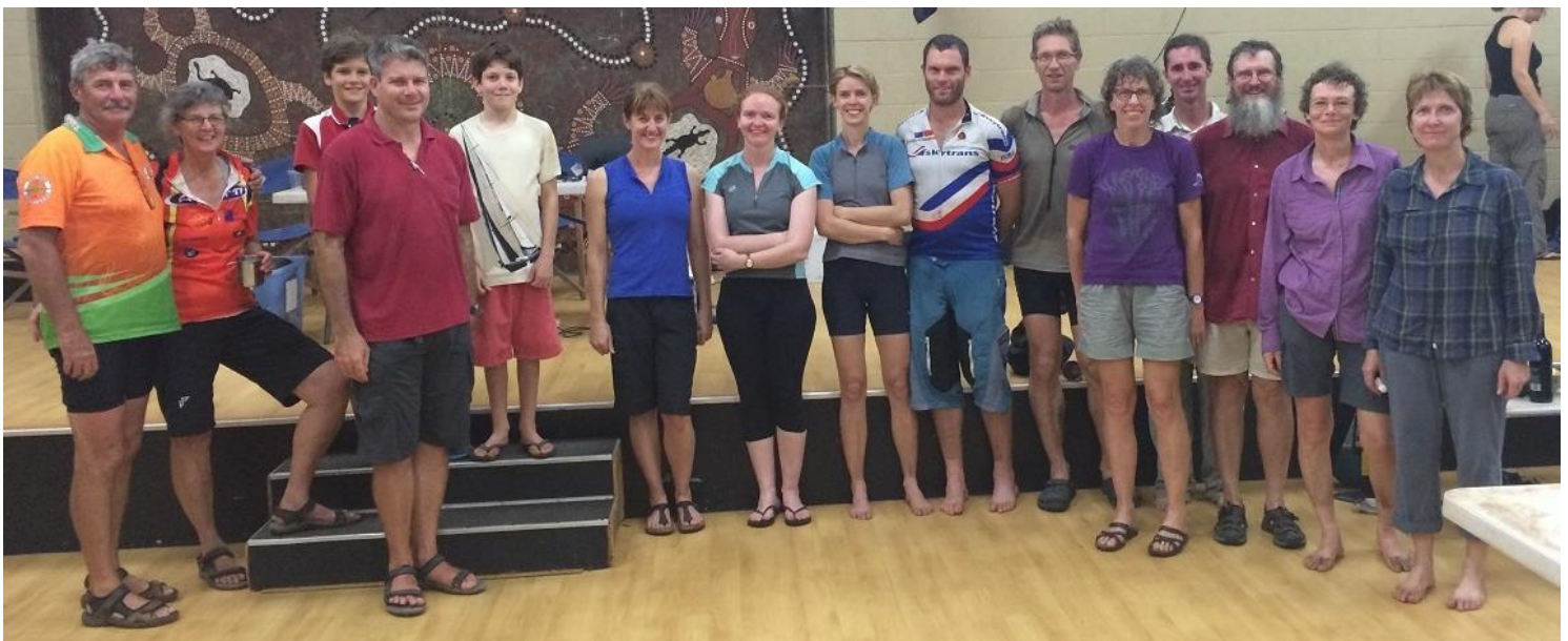
The Winners are Grinners even though it's 10 pm!

You have received this newsletter as a result of participating/showing an interest in one of our events. If you do not wish to receive correspondence from the NTRA, please reply to this email and put "unsubscribe" in the heading.