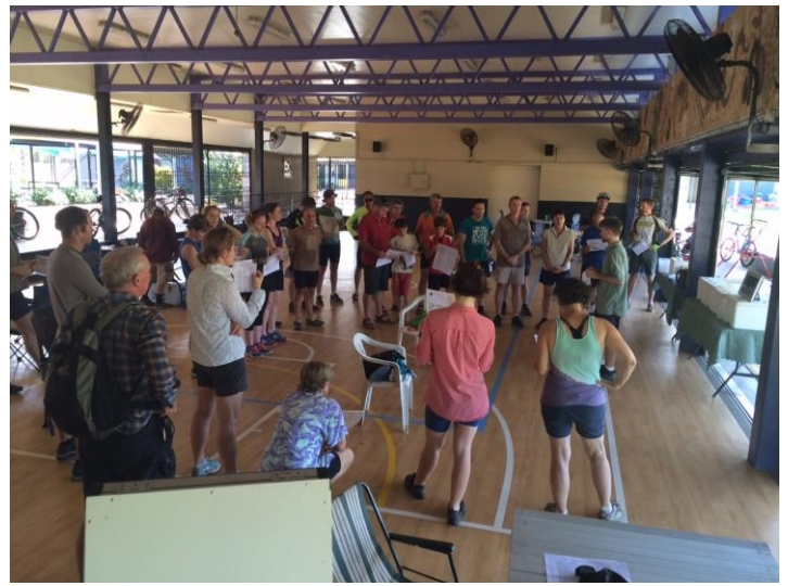
Cyclists pre-trip briefing