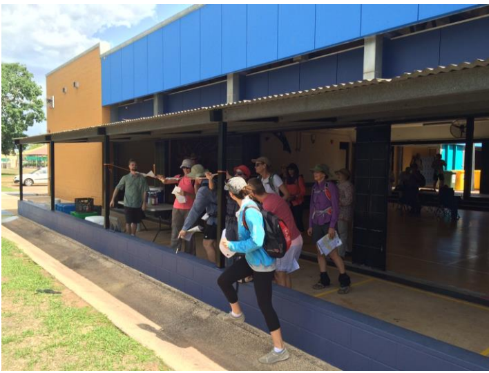
...and they're off and running!