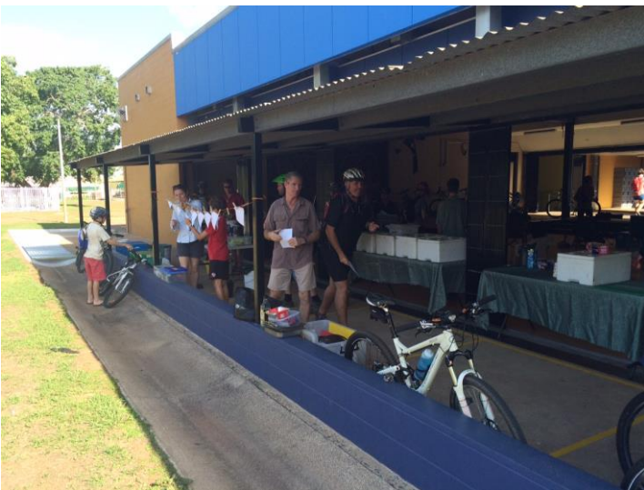
...and a more leisurely start for some of the cyclists